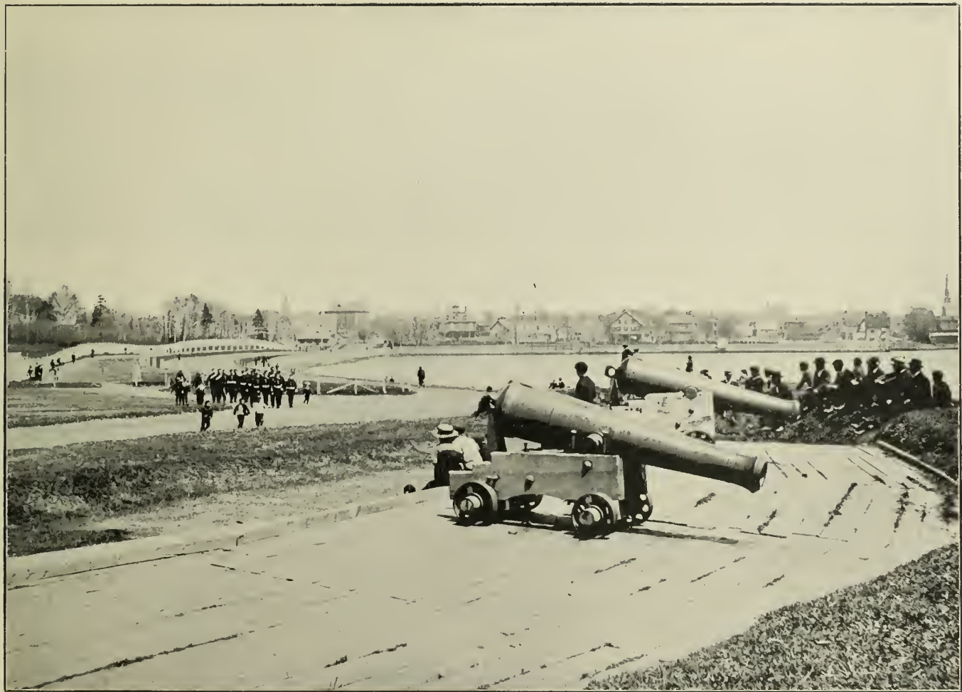
FORT EDWARD, CHARLOTTETOWN.